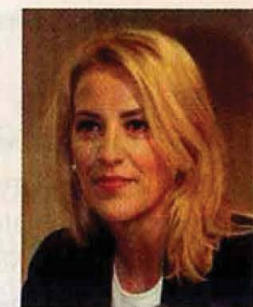
Rena Dourou Regional Governor

"We strongly believe in the significant role of regions in the Fourth Industrial Revolution. Therefore, the Attica region employs a strategy based on targeted synergies with important stakeholders, such as the Athens Chamber of Commerce and Industry (ACCI) and innovative new business entities from the Athens Startup Business Incubator (THEA). We create an ecosystem conducive to new forms of entrepreneurship, smart specialization and innovation. This is the only way to achieve growth in an intelligent, inclusive and sustainable manner".